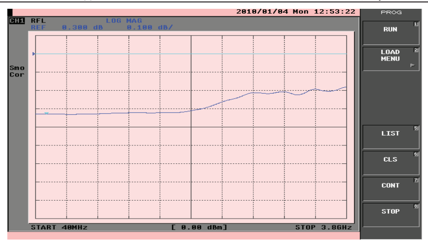
Fig. 3: Reflection loss of new hexagonale thin film absorber (Fe Co O)

НАУЧНИ ТРУДОВЕ НА РУСЕНСКИЯ УНИВЕРСИТЕТ - 2012, том 51, серия 3.1