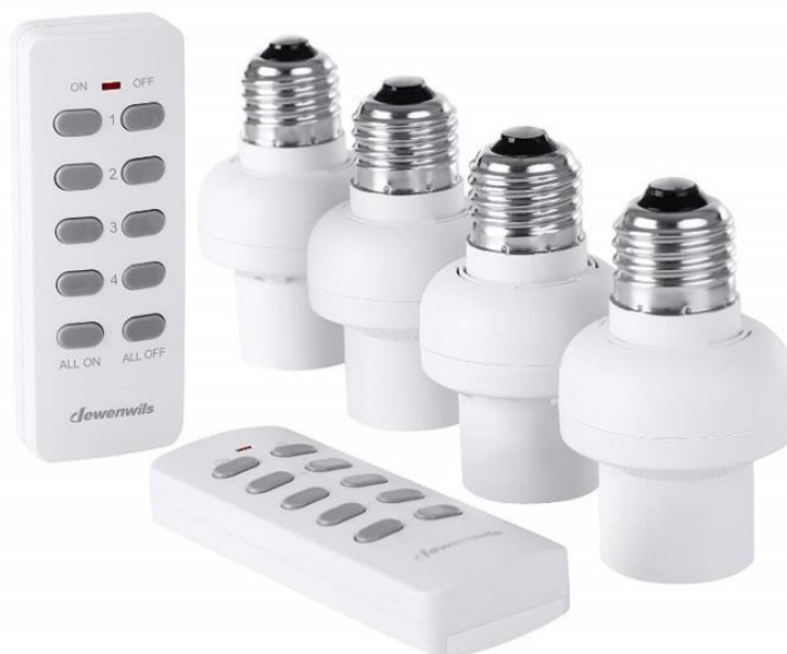
Fig. 5. Remote control of separate light sources