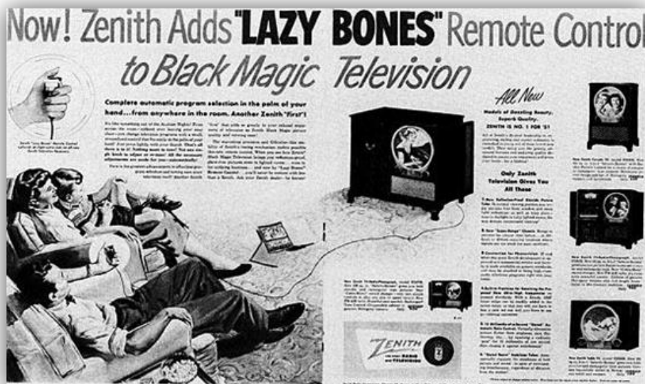
Fig. 1. The first "Lazy Bones" remote control to be launched