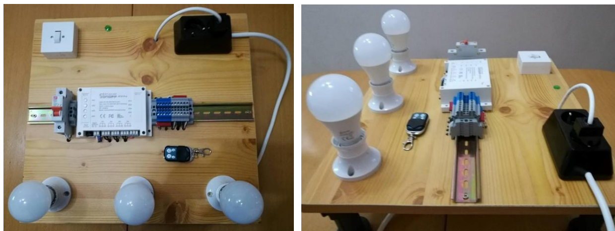
Fig. 11. Stand for remote control of lighting systems, with the use of controller "Sonoff 4Ch Pro"