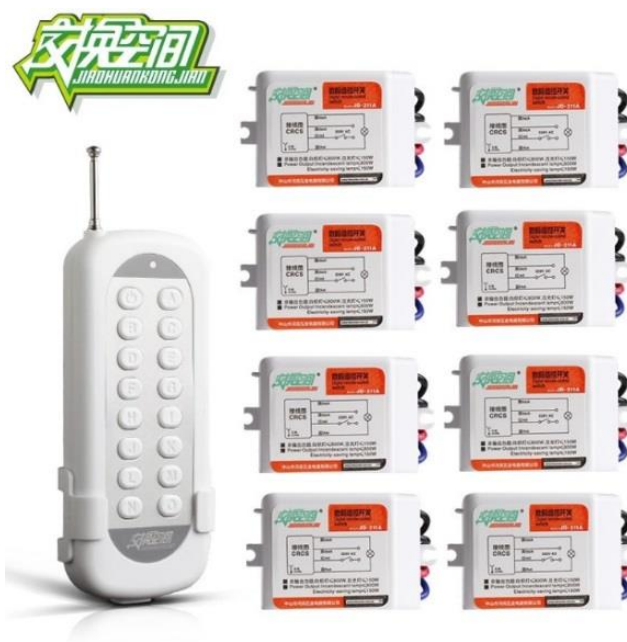
Fig. 6. Remote control of separate light sources, with separate actuators

In Fig. 7 shows a more flexible lighting management solution. The device is a module controlled via a WiFi network. In addition to the on and off functions, smooth control of the luminous flux as well as remote control outside the premises can be implemented. The limitation here is that the control is only done by a single luminaire.