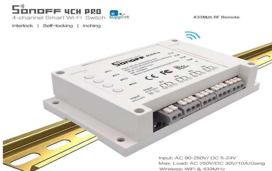
Fig. 9. Sonoff 4Ch Pro Remote Controller