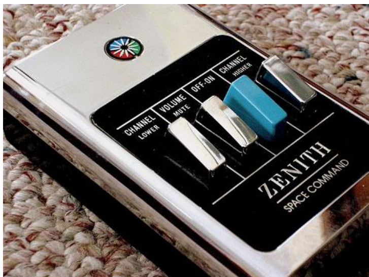
Fig. 3. Ultrasonic Space Command Control Panel (without batteries)