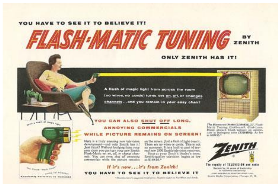
Fig. 2. "Flash-Matic" - the first light wireless remote control for TV

In 1956, the Space Command console (Fig. 3) came to the market with great success, and in 1959 virtually all TV manufacturers equipped their expensive models with similar consoles. Zenith's marketing experts have conditioned the device to have no batteries and engineers have come up with a brilliant solution - a mechanical ultrasonic transmitter. When a button was pressed, a hammer struck a hammer on one of four tuning forks, and the TV, equipped with a microphone receiver, commanded.