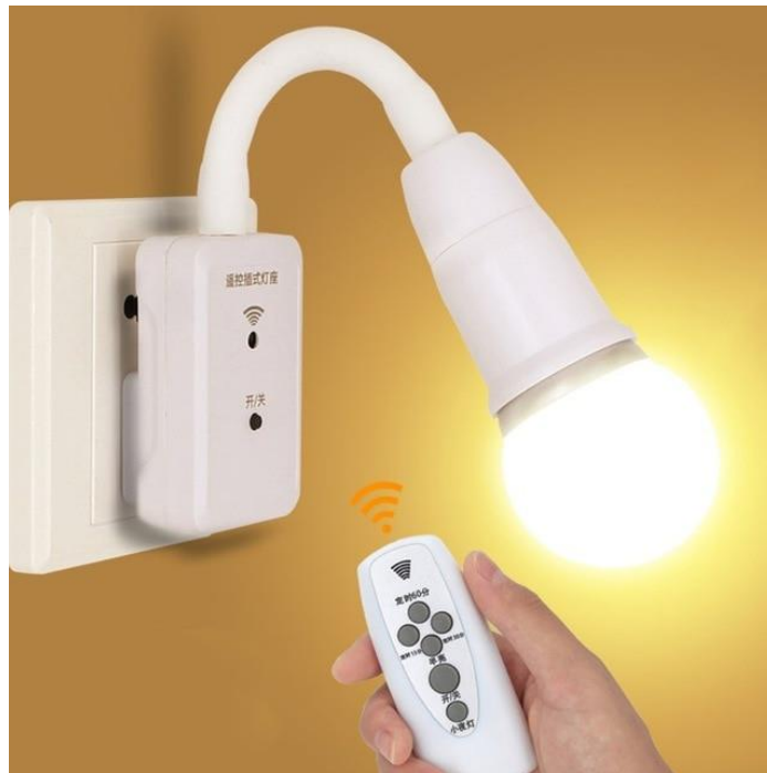
Fig. 7. Remote control of a separate light source using WiFi network

publication, not all of them will be considered.