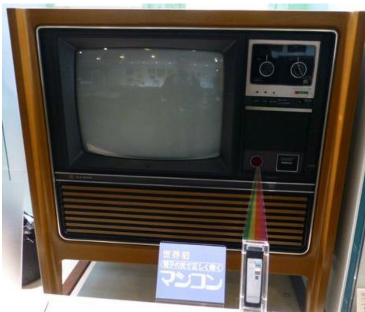
Fig. 4. Matsushita's first Colour Television with Infrared remote control National TH-6600FR