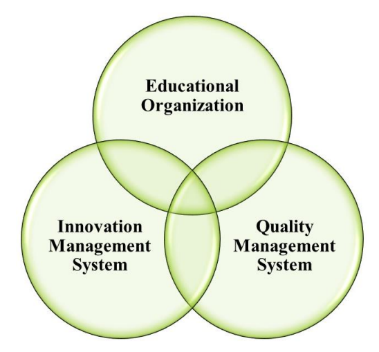
Fig. 1. The general idea for improving the educational management system