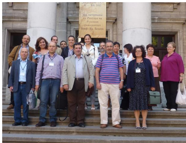
Participants in NODDEA'2012

Department of Mathematics, Room 1.221, Faculty of Natural Sciences and Education, University of Ruse, 8 Studentska str., Ruse 7017, Bulgaria