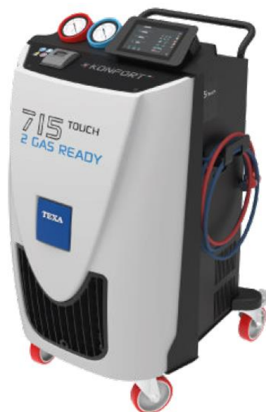
Fig. 1. Texa KONFORT 715 TOUCH car air conditioning system service machine

Before conducting the experimental tests, a visual inspection was performed on the pipelines, fittings, condenser, and evaporator to check for corrosion or deformation, and an electronic leak detector was used to ensure system integrity. To facilitate and improve the accuracy of refrigerant mass measurement during charging, a standard automotive air conditioning service station – Texa KONFORT 715 TOUCH – was employed (Fig. 1).